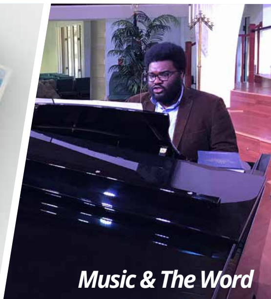
Music & The Word